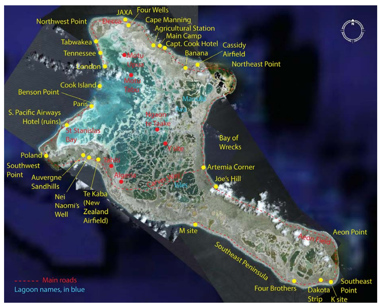
Figure 2. Kiritimati Atoll showing all localities mentioned in this article. Adapted from Google Earth. Image © 2015 DigitalGlobe.