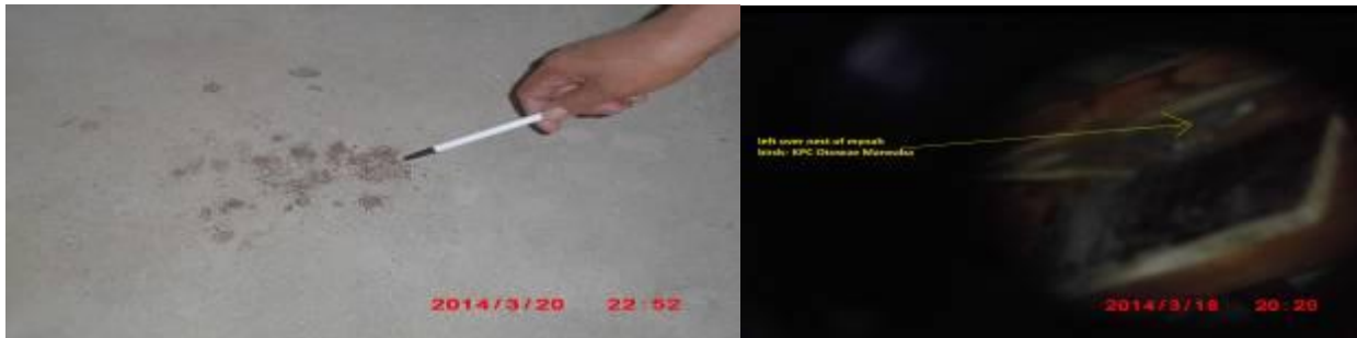
Diagram 1: Mynah faces and left over nest inside KPC Otowae.