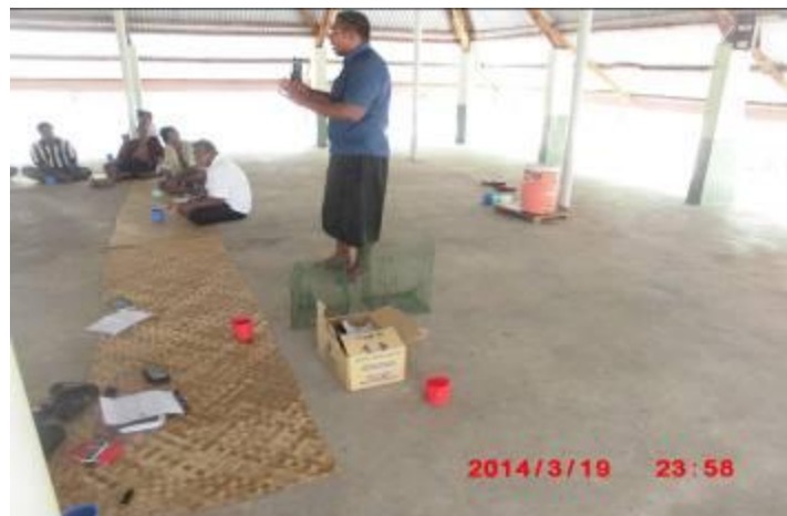
Diagram 4- Team 1- constructing trap during the workshop.