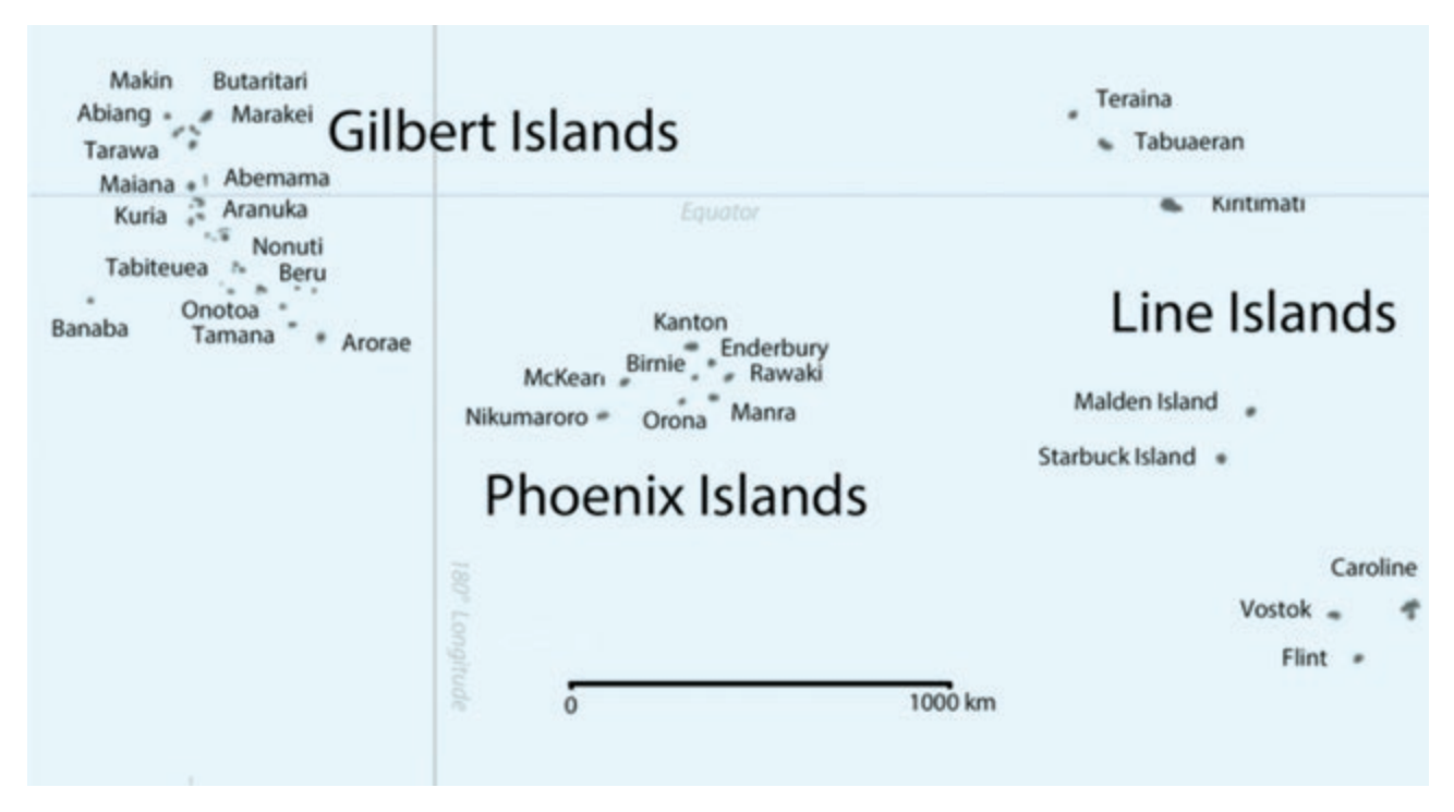
Figure 1. Map of Kiribati

The boundaries and names shown on this map do not imply official acceptance or endorsement by the International Renewable Energy Agency.